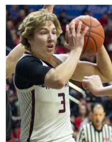
ILLEGAL - color