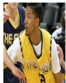
ILLEGAL - color